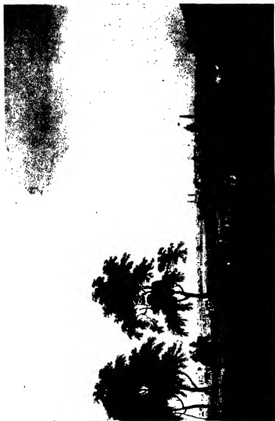
PART OF THE BLACK TOWN. After the aquatint of Thomas Daniell.